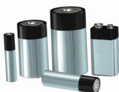
AA AAA C D 9-volt

ALKALINE BATTERIES contain no hazardous materials and can be safely put in the trash